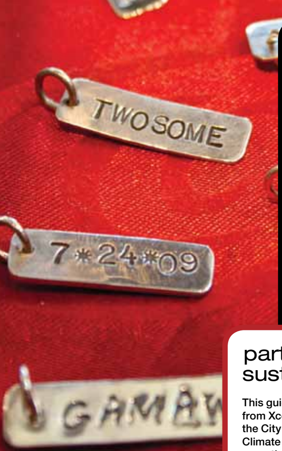
Photo taken at Elizabeth Lindsay Creations. Cover photo taken at Hutch & Fig. Guide printed in 2011.

What's all this hubbub about buying local? Well, to put it simply, when you shop at locally-owned businesses, your money makes a bigger impact in your community. We're talking more jobs, fewer carbon emissions, and vibrant, lively neighborhoods. Learn more at ColoradoLocalFirst.com